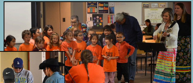
Michif Early Learners from Stobart Community School