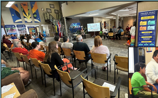
National Day for Truth and Reconciliation program at Division Office

The Prairie Spirit Board of Education demonstrates its commitment to this important work through a dedicated Board policy : Indigenous Perspectives, Partnerships and Outcomes. Prairie Spirit's Board of Education is a leader in this area in the province.