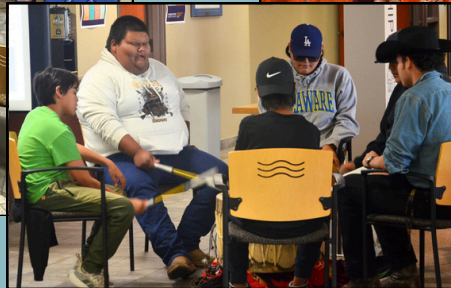
SkyBoyz drumming group from Stobart Community School