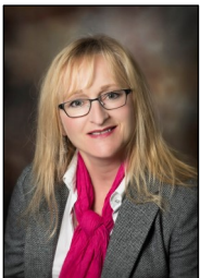
Subdivision 7 Dawne Badrock Clavet Dundurn Hanley South Corman Park Hillcrest Colony Lost River Colony