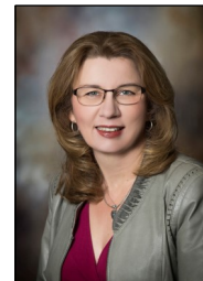
Subdivision 9 Bonnie Hope Martensville