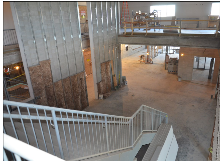
A view from the second floor of the Traditions Elementary School in Warman

Although the school division plan lists over $50 million in needed maintenance projects, Prairie Spirit's PMR budget for 2016/17 is $1.7 million. Projects that exceed this budget must be approved by the Ministry of Education.