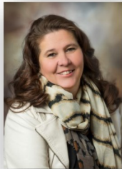
Subdivision 1 Pam Wieler Blaine Lake Laird Leask Waldheim Green Leaf, Riverbend and Leask Colonies