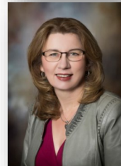
Subdivision 9 Bonnie Hope Martensville