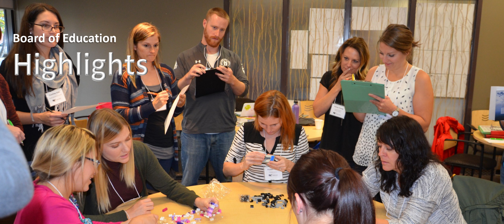
Prairie Spirit's new teachers met for a day of learning together on Friday, September 23 at Division Office.