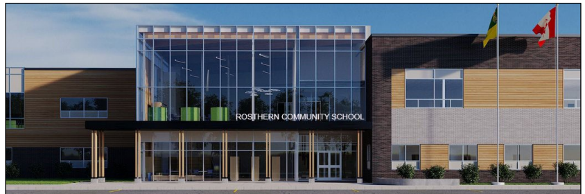
Architect's illustration of Rosthern Community School

The school's new name adds to the excitement during the construction phase. The school will open for students in fall 2020.