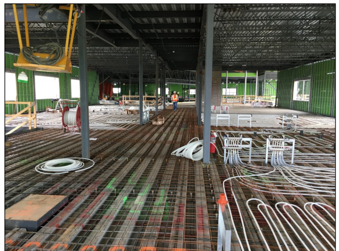
Photos taken on May 23 show the progress at the Rosthern Community School construction site