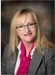
Subdivision 7 Dawne Badrock Clavet Dundurn Hanley South Corman Park Hillcrest Colony Lost River Colony