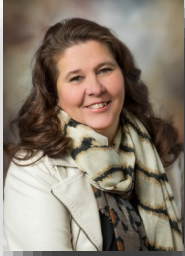
Subdivision 1 Pam Wieler Blaine Lake Laird Leask Waldheim Green Leaf, Riverbend and Leask Colonies