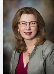
Subdivision 9 Bonnie Hope Martensville