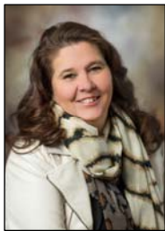
Subdivision 1 Pam Wieler Blaine Lake Laird Leask Waldheim Green Leaf, Riverbend and Leask Colonies