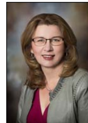
Subdivision 9 Bonnie Hope Martensville