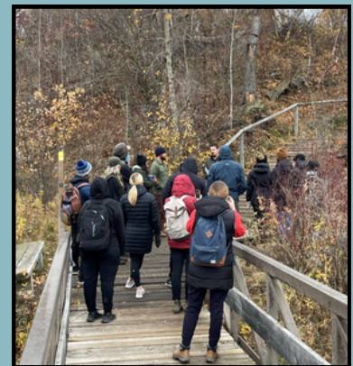
Prairie Spirit teachers participated in a Medicine Walk with Métis-Nation Saskatchewan