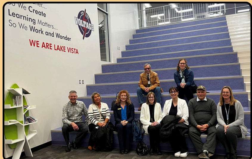
Lake Vista Public School

The Board invites feedback from students, families, stakeholders and the public. Please contact your Trustee or email: contact@spiritsd.ca .