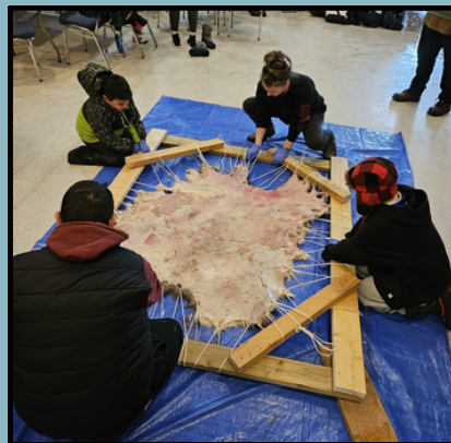
Blaine Lake students learn alongside Knowledge Keepers and Elders in the preparation of a moose hide