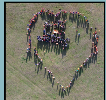
Stobart Community School students & staff participated in a Round Dance on Orange Shirt Day