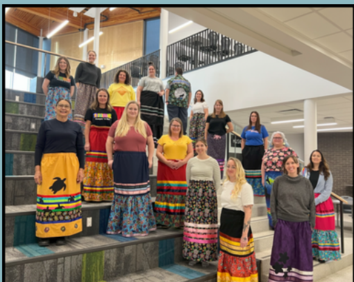
Prairie Spirit teachers participated in a learning opportunity to create ribbon skirts - Fall 2023