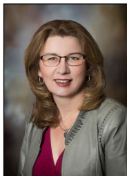
Subdivision 9 Bonnie Hope Martensville