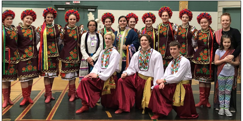
Ukrainian, First Nations and Métis dancers at Culture Days at Leask Community School