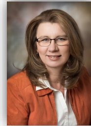
Subdivision 9 Bonnie Hope Martensville