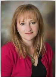
Subdivision 7 Dawne Badrock Clavet Dundurn Hanley South Corman Park Hillcrest Colony Lost River Colony