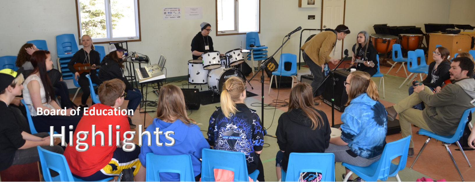
The second annual Prairie Spirit Resonate Student Music Conference was held April 14 and 15 at Beaver Creek Camp. In total, over 200 students attended the conference, which also included a PD day for teachers on April 13.