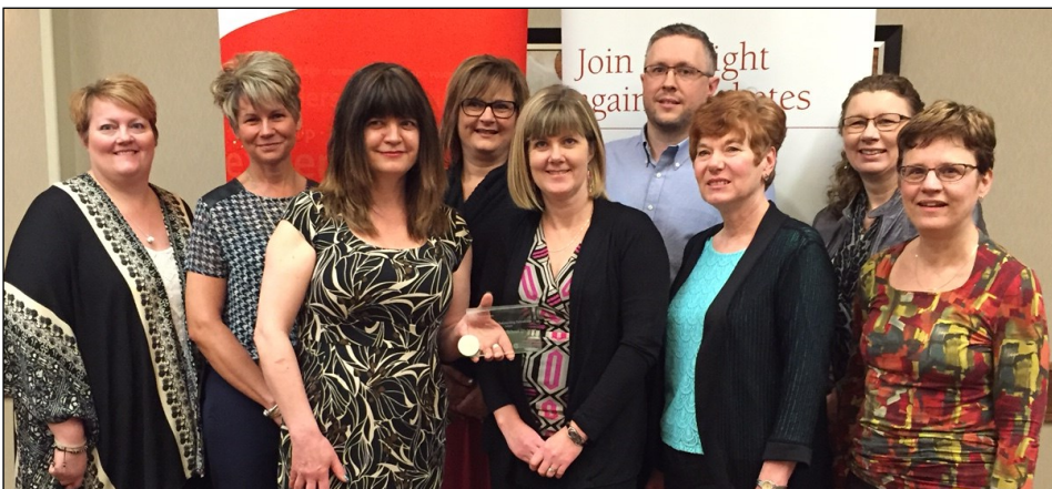
Prairie Spirit representatives at the Canadian Diabetes event, left to right:

Congratulations to all involved in this important work!